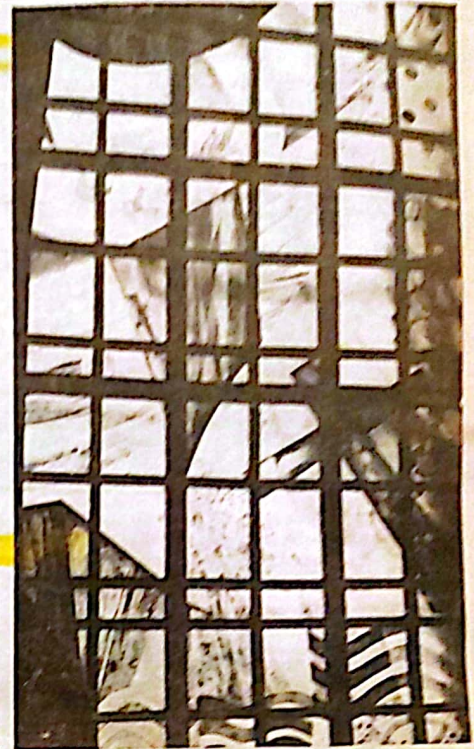
STAINED GLASS WINDOW — The stained glass window above the entrance of St. John's Church, Madison.