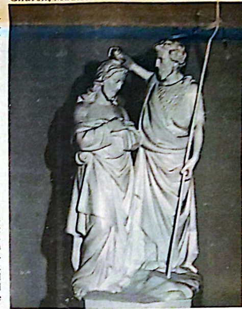
STATUE OF PATRON SAINT — John the Baptist baptizing Jesus is depicted in marble, and is in the foyer of St. John's Church, Madison.